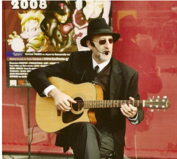
Performing at a festival in France