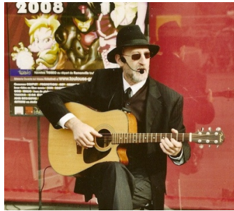
Performing at a festival in France